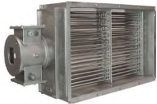
Air duct heater